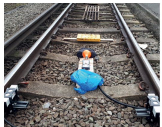
Equipment to measure emissions at axle counter and TPWS frequencies