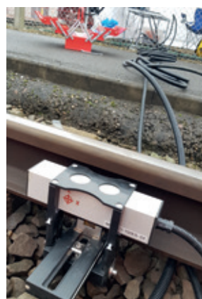
Antenna for measurement of magnetic fields affecting axle counters